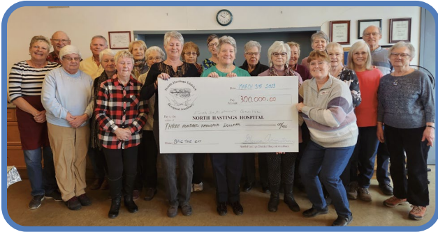
Pictured here are some of the members of the North Hastings Hospital Auxiliary and the Back the Cat team receiving a pledge of $300,000 for the campaign.

The Back the Cat campaign has succeeded in fostering a strong sense of community engagement and support. The overwhelming response and active participation from individuals, businesses, and organizations have demonstrated the immense value placed on accessible and high-quality healthcare.