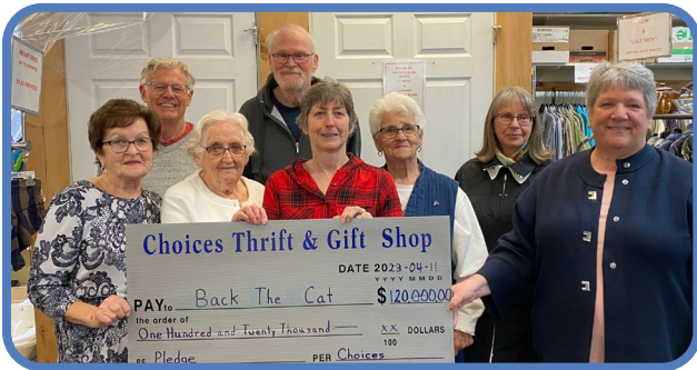
Choices , an all volunteer program in Bancroft, has pledged a total of $120,000 over the next 5 years for Back The Cat with their first instalment already made in early April 2023.