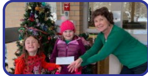
Students of Bird's Creek Public School donate $200 from their Trinkets and Treasures Day. In total the B.C.P.S. has donated over $5000.00 and is being recognized on our Donor Wall.